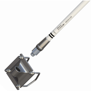
Kit Includes: Antenna, Rubber waterproofing shield, Mounting bracket, U-bolts, Hardware for U-bolts (Screws for bulkhead mounting not included)

Built for maximum performance, this 4' broad band antenna is designed to endure the harsh environment and communication requirements in commercial, law enforcement and disaster management applications. Whether you install it on a vessel, base station, or a stationary platform, this antenna provides a host of mounting options to fit your need. No tuning or ground plane required. Cable not included.