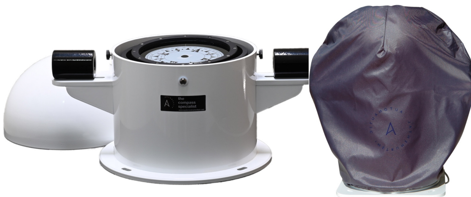
125mm Class A compass card